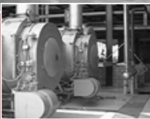
All self-generation boilers, including the different types pictured here, take up a lot of valuable floor space.